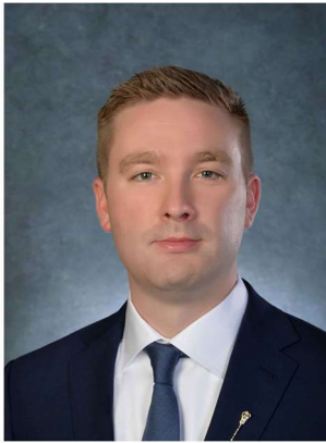
The Honourable Jeremy Cockrill Minister Responsible for Saskatchewan Water Security Agency

I am pleased to present the Water Security Agency's (WSA) Business Plan for 2023-24.