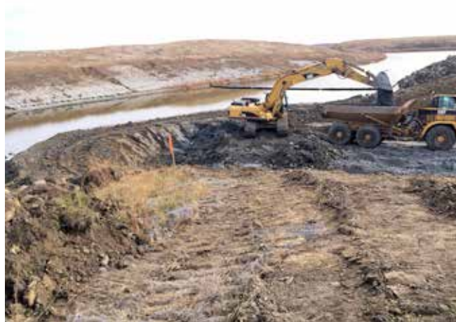
Boundary-Rafferty diversion channel erosion repairs

We currently own and operate 49 dams in the province, ranging from large, like Gardiner Dam that forms Lake Diefenbaker, to small earth dams. These dams provide water supplies and recreation. Major dams also mitigate the effects of flooding. You'll specialize in the fields of dam safety, dam operations