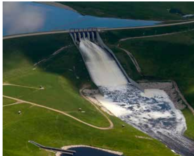
Alameda Dam spillway, Souris River flood, June 23, 2011

and maintenance, or geotechnical engineering, and be part of the team that ensures all of our dams are operated and maintained in accordance with our Dam Safety Management Policy. In this way, we know that our dams are safe and we can maximize their benefits for the citizens of Saskatchewan. The job involves working closely with colleagues, managing the work of engineering consultants, providing oversight of all aspects of dam safety management, conducting dam safety inspections,